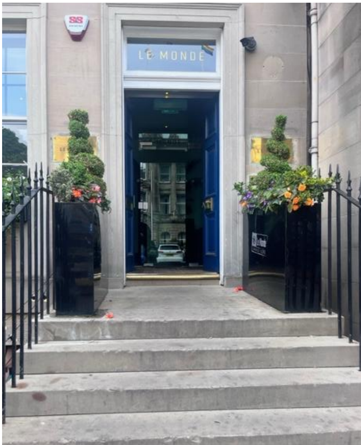
An image showing Le Monde Hotel's reception entrance.