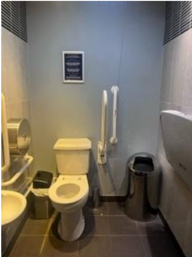
Image of the accessible toilet