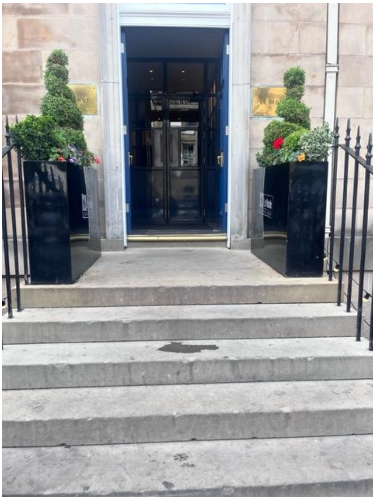
An image showing Le Monde Hotel's Bar entrance.