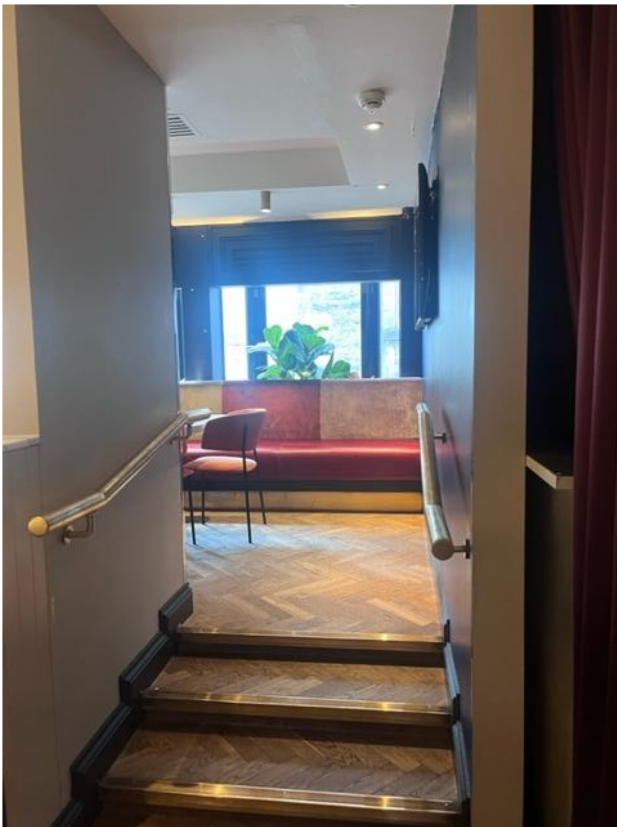
3 images showing the steps to the private hire areas.