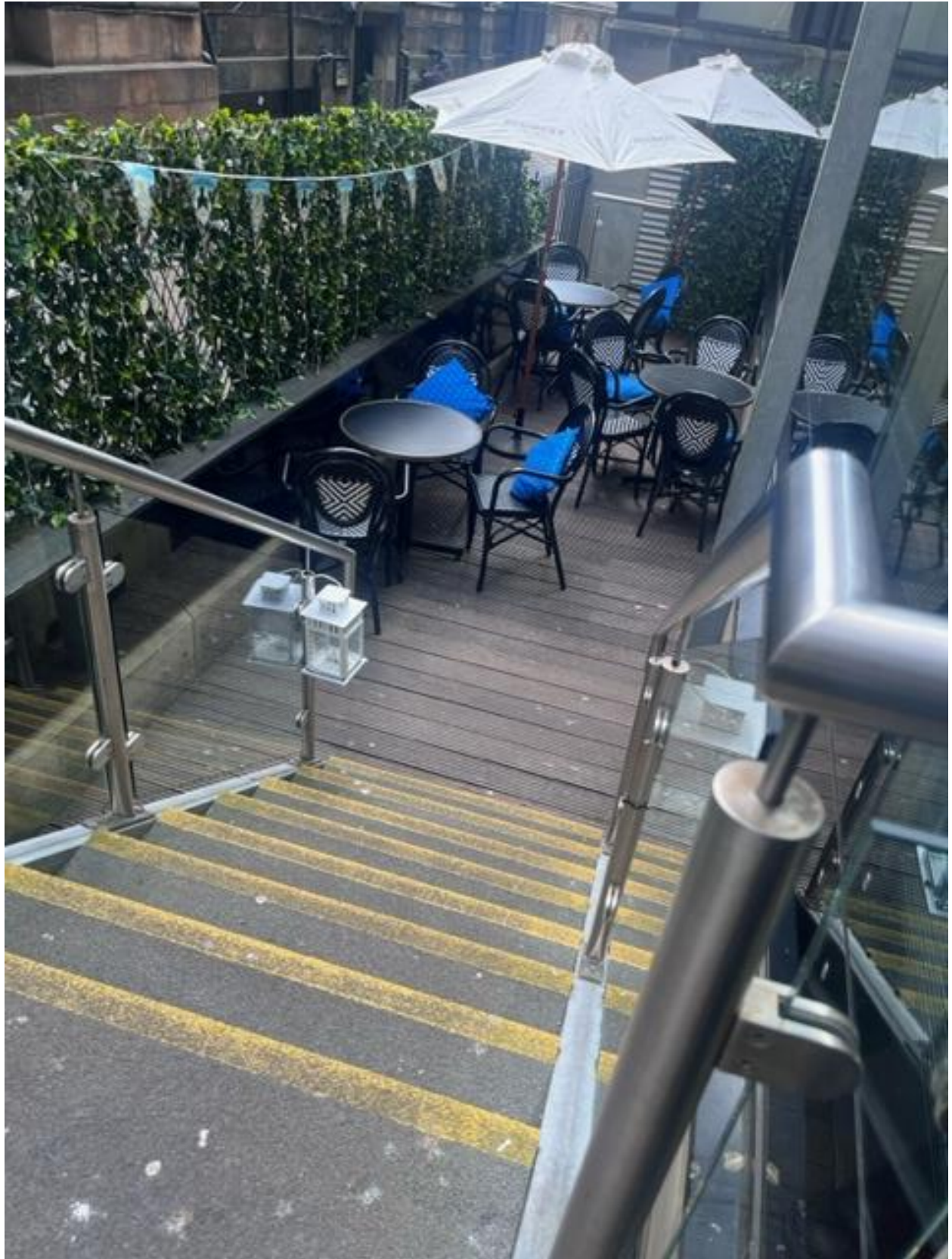
An image of an outside smoking area with tables and chairs