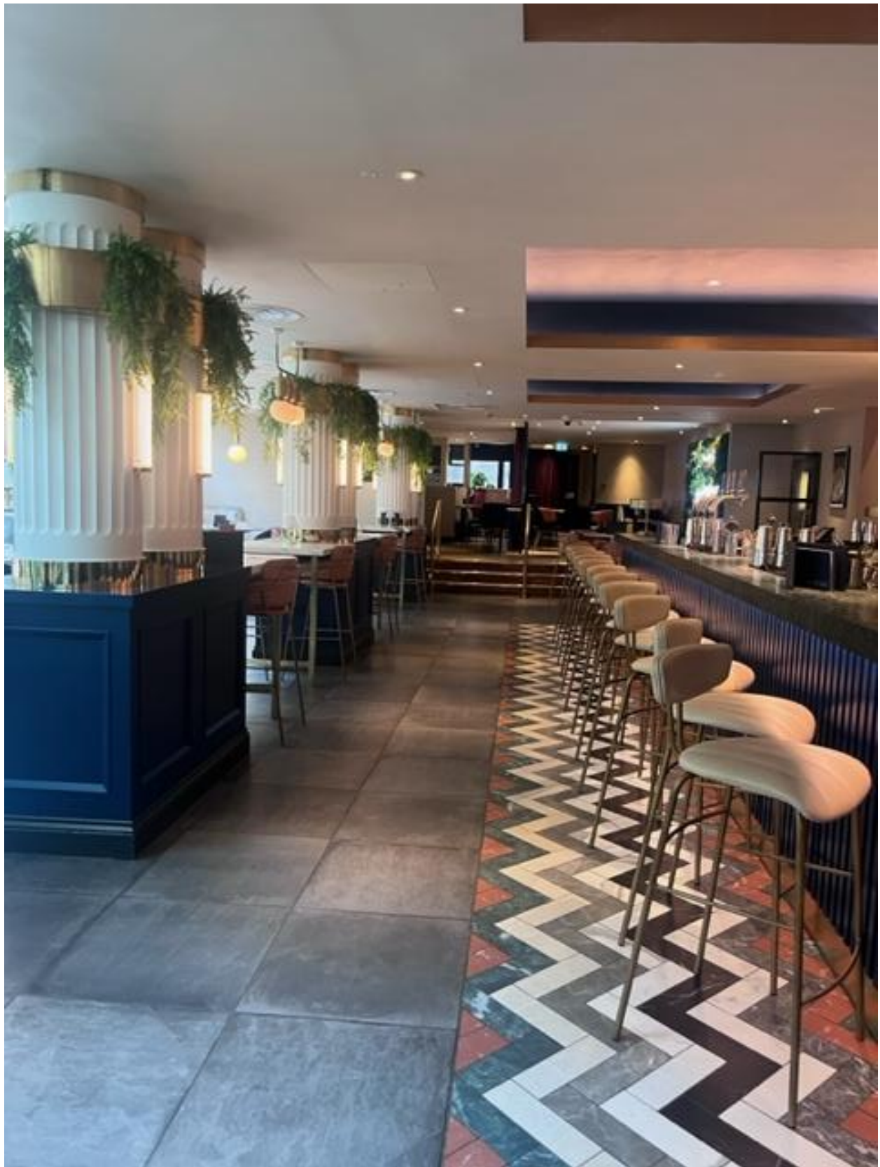
An internal image of Le Monde Hotel Main Bar area, showing a wide access route and